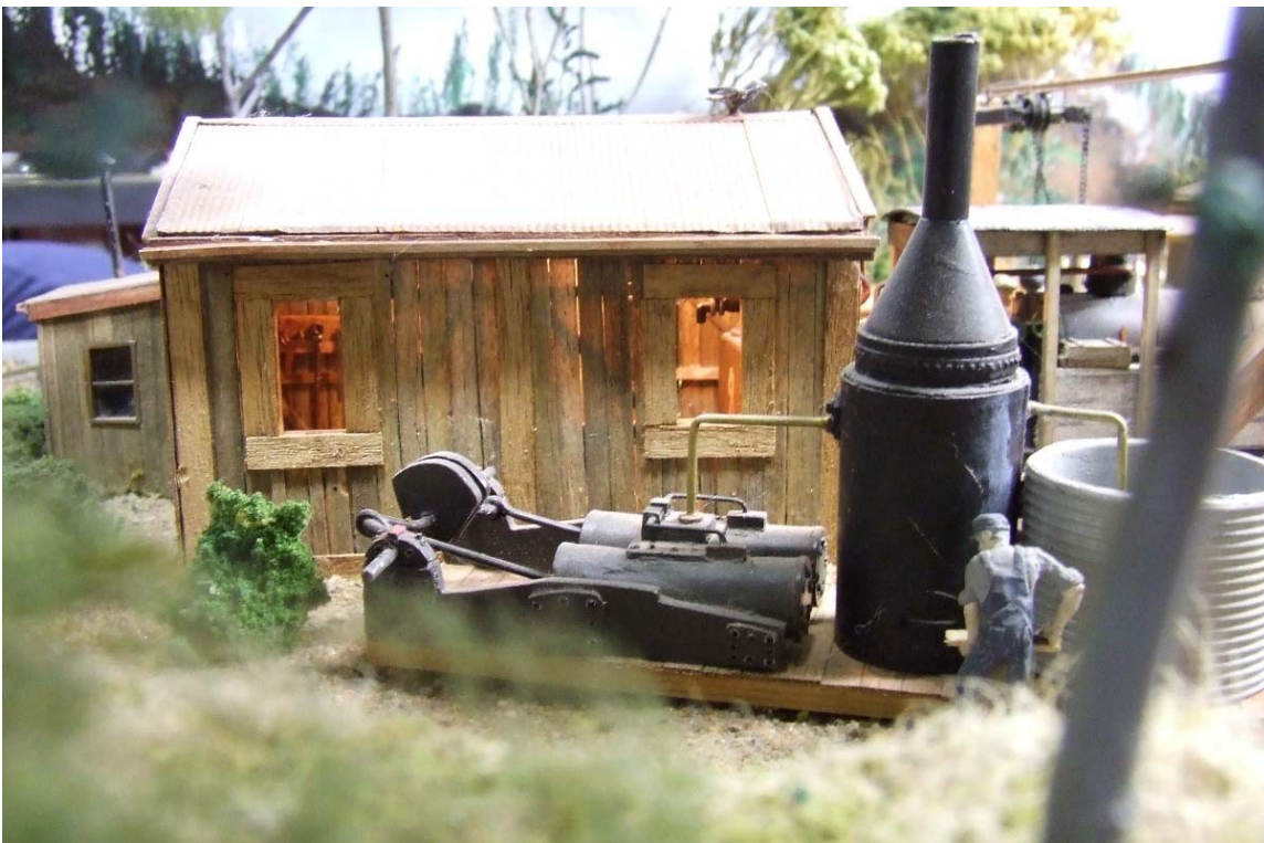
Below: a scene from Tee Tree

At pack up time the public voting was announced and in first place was Poweltown, Kangaroo and Cockatoo came second and we with Paradigm were in third place. It is nice to know that we put on another good showing.