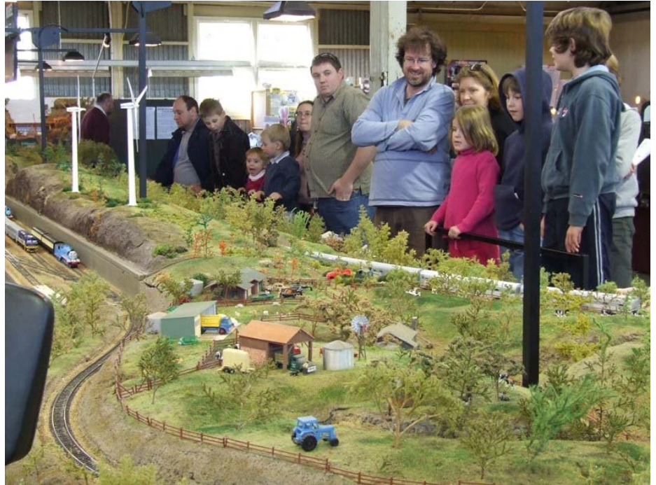
Above: The crowd anticipates the next run of Thomas and friends on Paradigm

There were about 40 layouts, traders and displays including a modelling competition and a good range of scales from Waddamama Power Station in Z scale to the full size Dunmunkle Sunpoilers who were outside on the grass with their collection of old engines,. Paradigm was display number 35 and in floor space probably the largest, we were surrounded by many familiar layouts, to the left was Powelltown, opposite was Kangaroo and Cockatoo Railway on our right the Ready To Run Group and behind was Mount Ash.