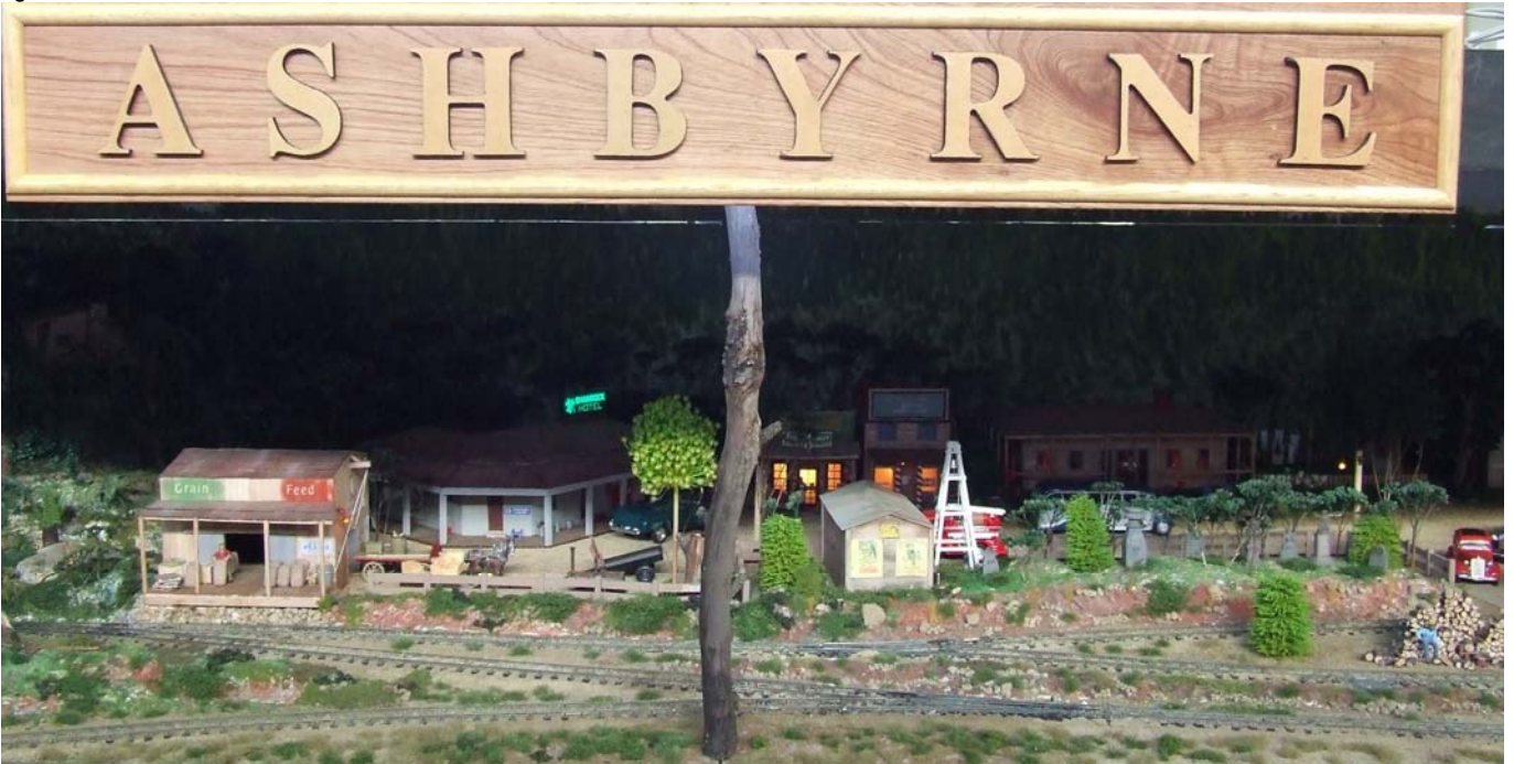
This page: Ashburn, a layout built with a roof and very dim lighting to set the scene at dusk