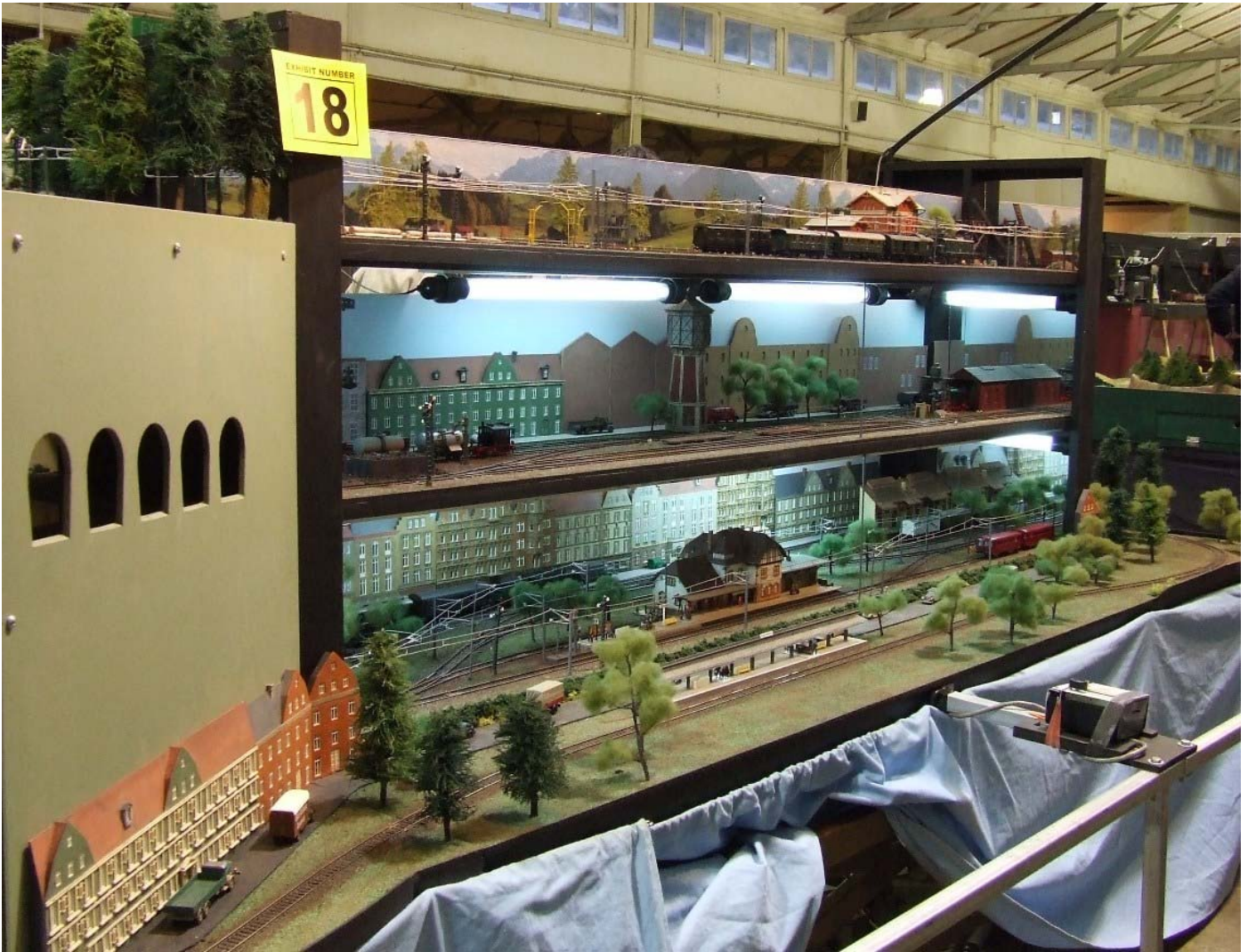
Above: "Tierbahn", an interesting triple level layout