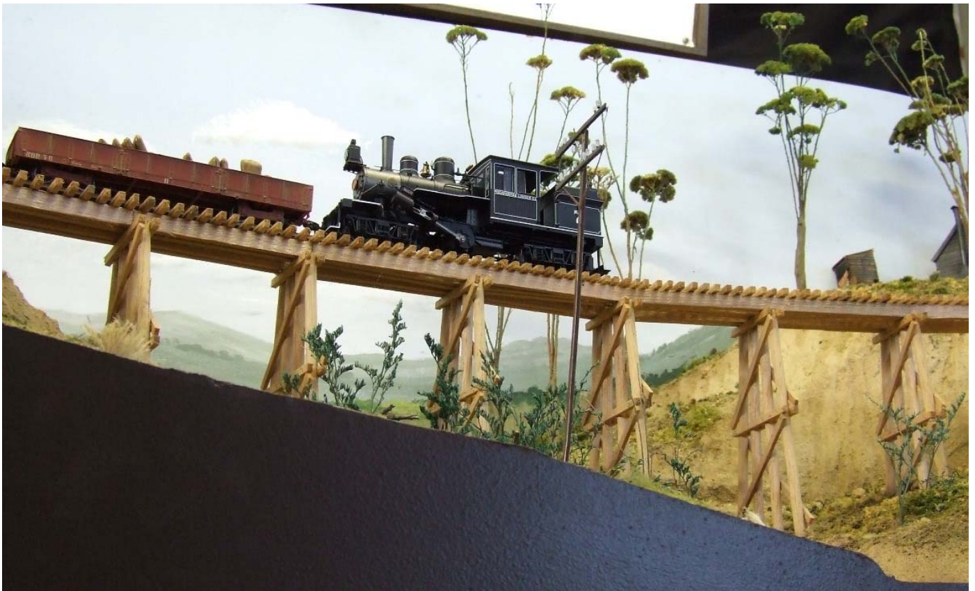
Above: A Climax crosses the trestle on “The Beachy” a beautiful On30 layout

Other more serious trophies on the night were to Little River Logging for best layout as voted by peers and also one for best structure. There were also awards for best loco, coach, etc but this reporter was a little slack and not paying enough attention at the time to record who won them. An encouragement award was given to Tierbahn a three level setup that created a lot of interest.