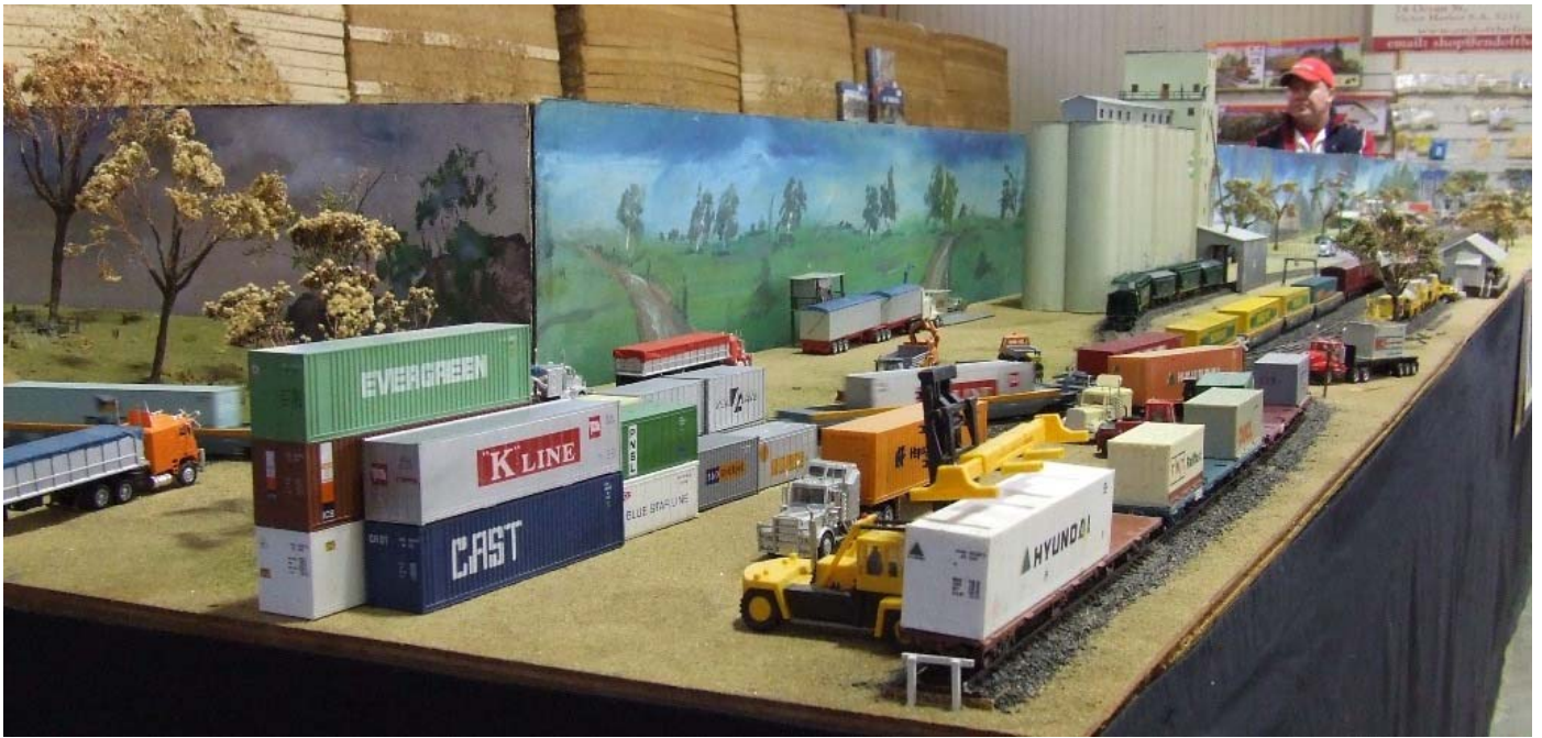
Below: “Millabah”, a privately owned layout